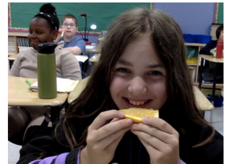
Students enjoying the breakfast club!

Picture Day is Tuesday and so is an anti-bullying presentation!