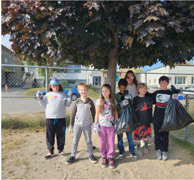
Cleaning up the school yard. Thank you!