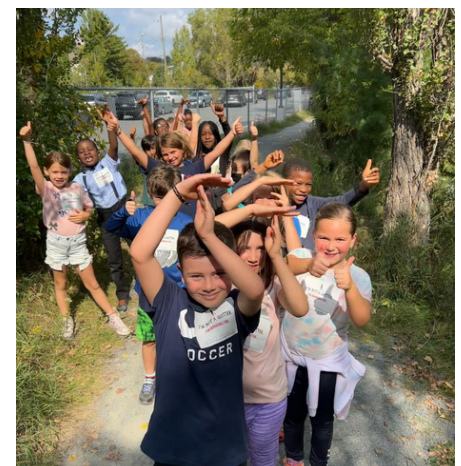
Students on the Terry Fox Run